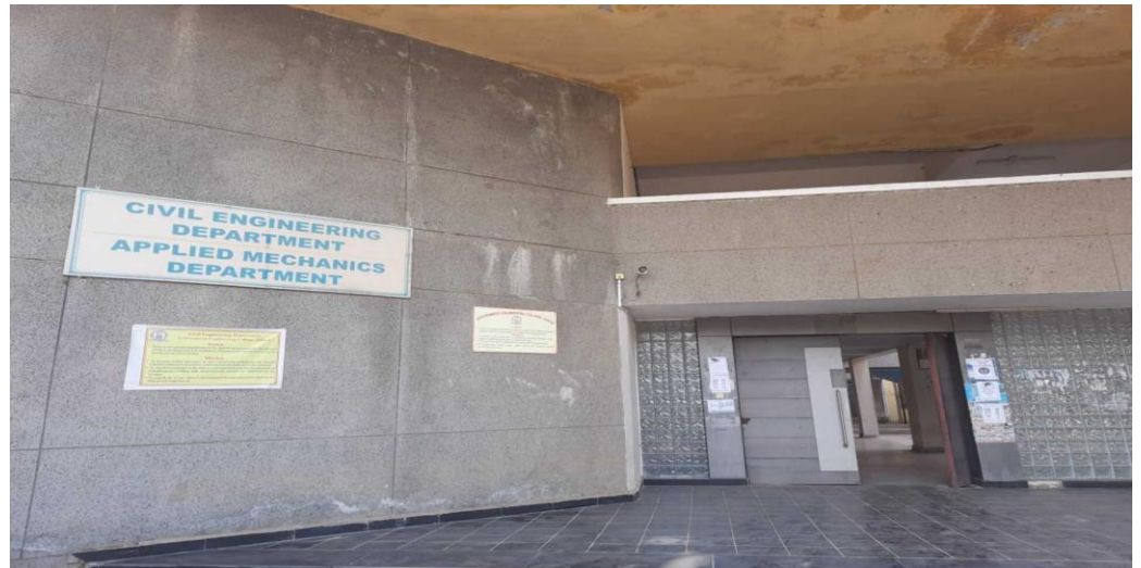
(Civil Department, Applied Mechanics Department)