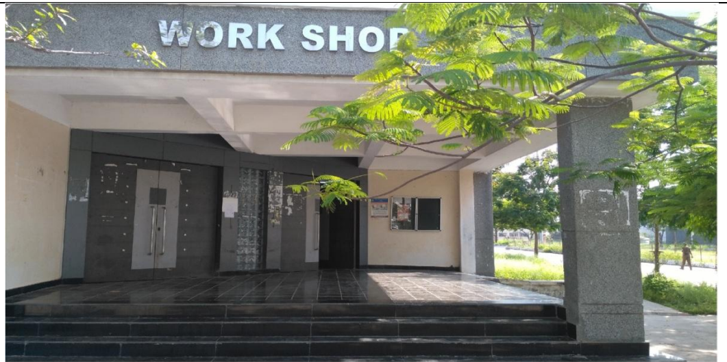
( Mechanical Workshop Building)