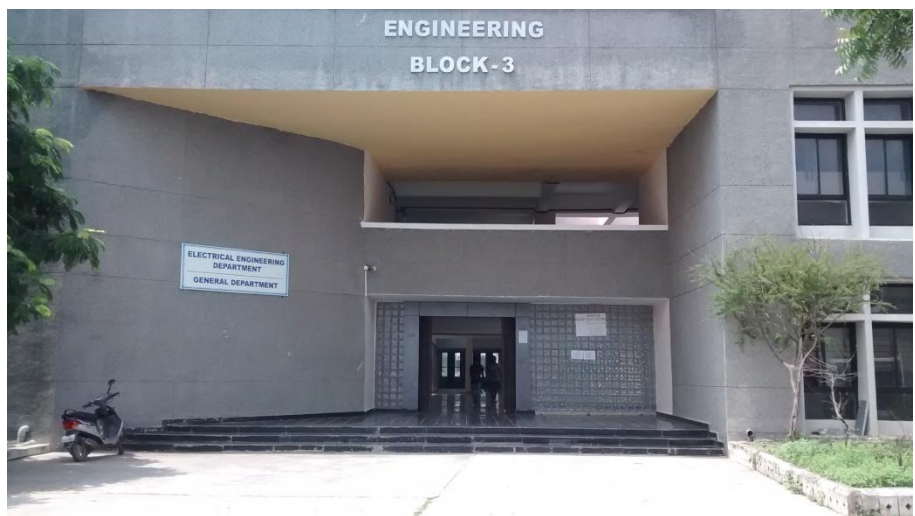
(Electrical Department, General Department)