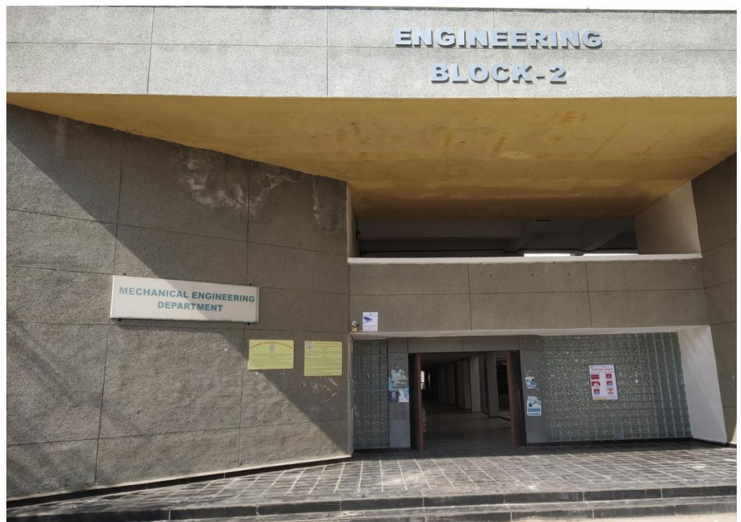
( Mechanical Department)